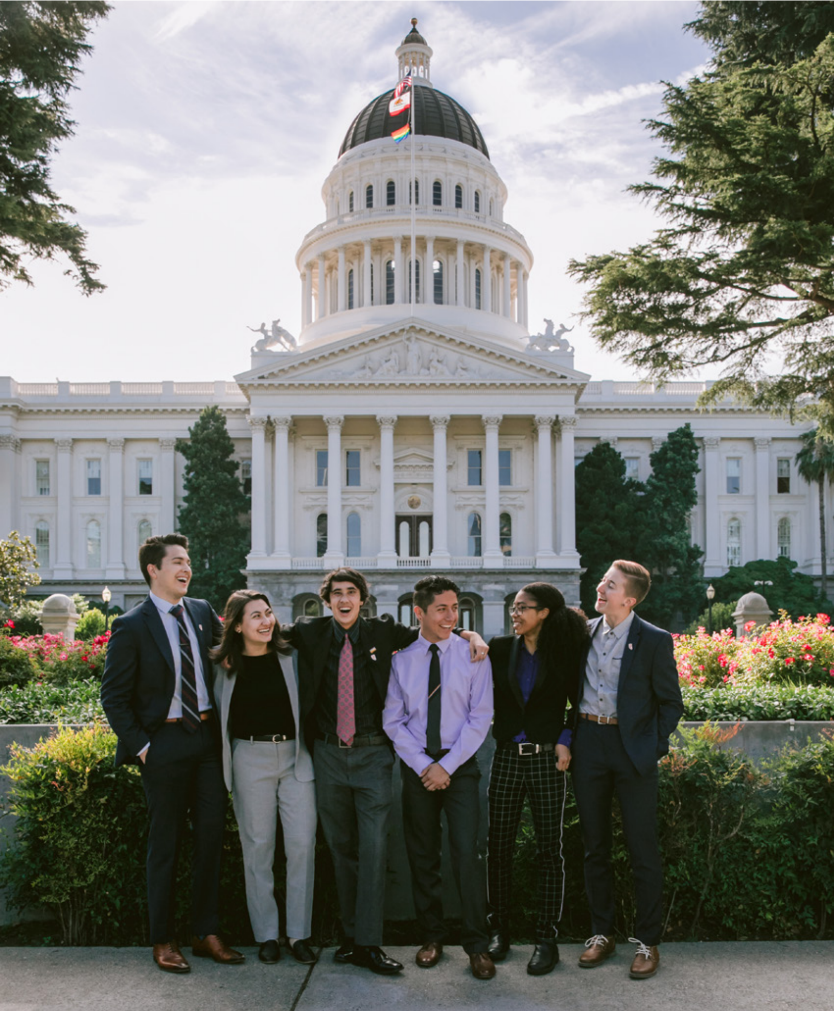
2019 Equality California Institute-Comcast Legislative Fellows