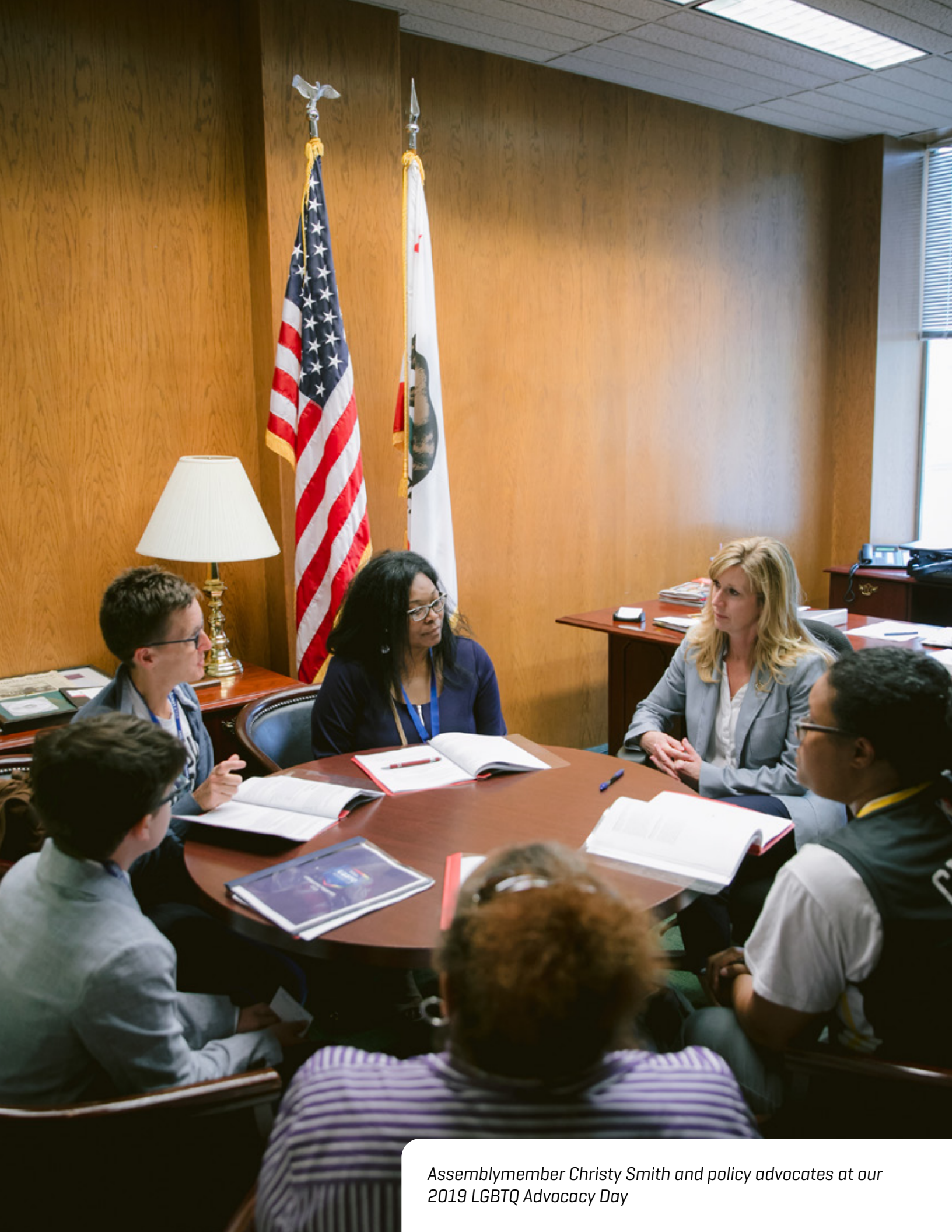
Assemblymember Christy Smith and policy advocates at our 2019 LGBTQ Advocacy Day